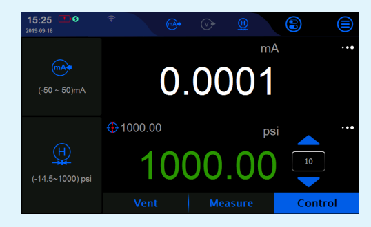
High Pressure Automated Calibration