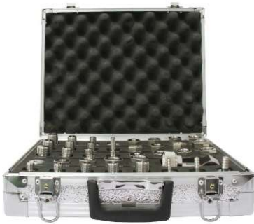
Model 1551 adapter kits, based on 1/4 NPT male, includes 38pcs adapters and 70pcs seals