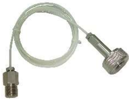
Model 1552 pneumatic flexible hose, -1 bar to 1 bar, 1/4NPT male to 1/4NPT hand tight female quick connector