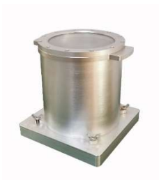
Model 1560 barometer chamber, pressure ranges -100kPa to 250kPa abs, internal size 165mm x 178 depth, outlet connector 1/8 NPT, 5.6kg net weight.