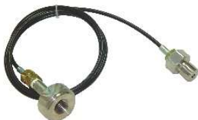
Model 1554 hydraulic flexible hose, 0 to 700bar, 1/4NPT male to 1/4NPT female hand tight quick connector