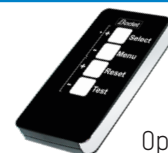
Option: wireless remote control